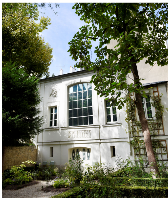
Exterior view of Delacroix's studio