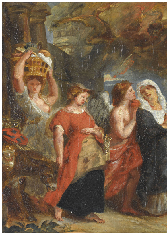
Eugène Delacroix, The Flight of Lot (detail) after P. P. Rubens