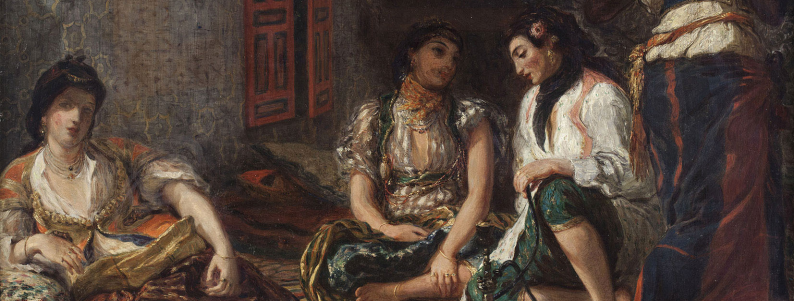
Henri Fantin-Latour, Women of Algiers in Their Apartment, after Eugène Delacroix (detail)